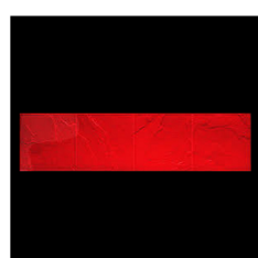
Square Slate Border