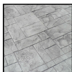
Small Ashlar Slate